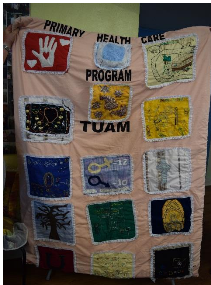
Primary Healthcare Quilt

Health as an area of work is one of the most significant for WTID. The overall aim of WTID's Primary Healthcare Programme (PHC) is to improve the health status and quality of life for Travellers in Tuam and its environs by identifying the community's specific health requirements and the necessary health service provision. WTID implements one of the most successful PHC Programmes in the country and currently employs seven Community Health Workers (CHWs) on a part time basis. The work in 2016 was influenced by the findings of the All Ireland Traveller Health Study 2010. Key Performance Indicators (KPI's) for this year focused on cardiovascular health and mental health.