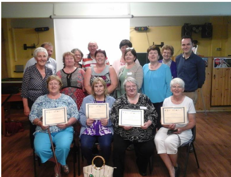
Participants receiving their certificate from Touchstone

Touchstone ran for 2 hours over an 8-week period in WTID. The course was free and it was a partnership between WTID, GRD, Galway Roscommon Education Training Board (GRETB) and NUIG. It was aimed at older people living in Tuam and its hinterlands. Course content included key issues for an ageing society and how these affect older adults; how to bring about improvement and change for older people; opportunities available for older people who wish to be actively involved in community life; getting started with research; and planning and managing practical projects. 22 people were registered on the course