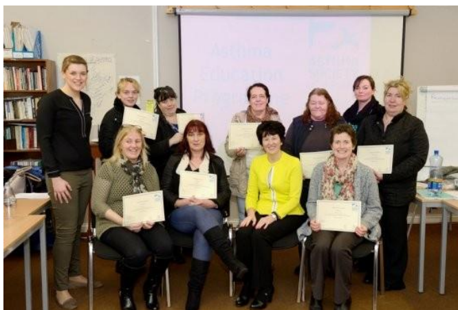
Asthma Refresher Training delivered by the Asthma Society of Ireland

The mainstay of the PHC Programmes work continues to be health promotion, and signposting to relevant service/agencies, be it for health screening, support or intervention. Outreach work in 2016 was conducted about Cervical Check; Breast Check; Census 2016; Child Development and Immunisation; Early Childhood Care and Education (ECCE) Scheme; Healthy Heart; Mental Health Awareness, Asthma and wellness in pregnancy, to name but a few.