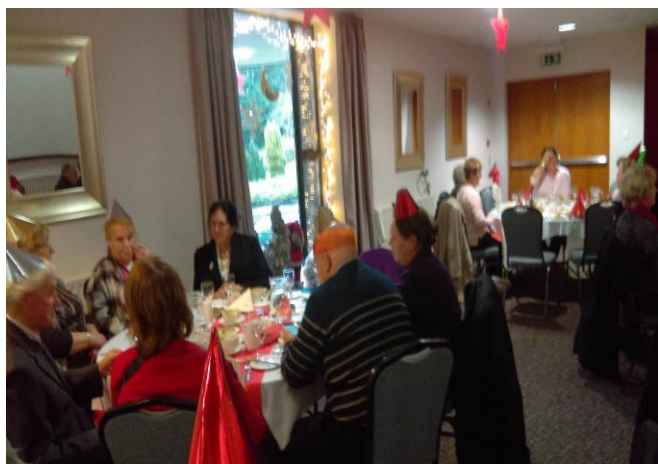
In the restaurant at the Knock House Hotel

This event would not have happened without the hard work and commitment of the staff of WTID who put in so many extra volunteer hours to ensure the event went well.