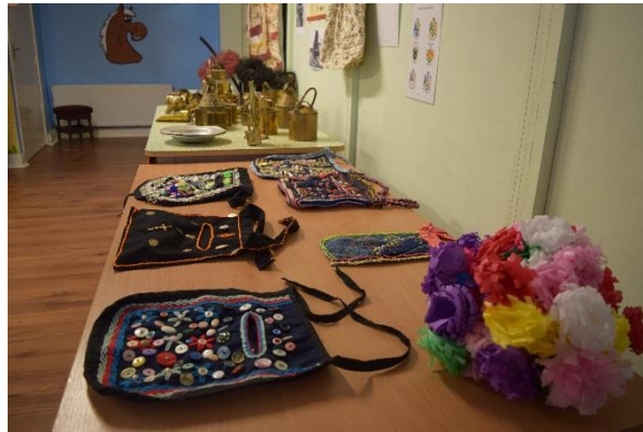
Pockets that would have been wore by Traveller women

Traveller Tracing started in March 2014, and is now into its Third year. During the past year, it was involved in some events, Traveller Pride Week, where it had a display for family trees, photography and craftwork.