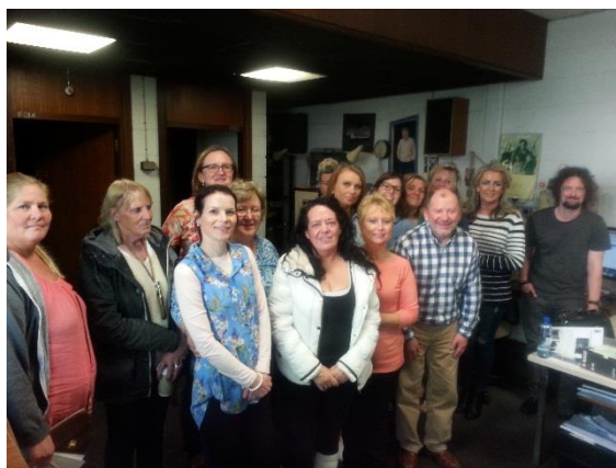
UCD Folklore Collection Fieldtrip

The aim of the Traveller History Project is to see collectors' interview members of the Traveller community in Tuam, Mayo, Roscommon and Galway about their memories and experiences of life in both traditional and contemporary Ireland. An archive of material will be created and an exhibition will be developed in partnership with museum