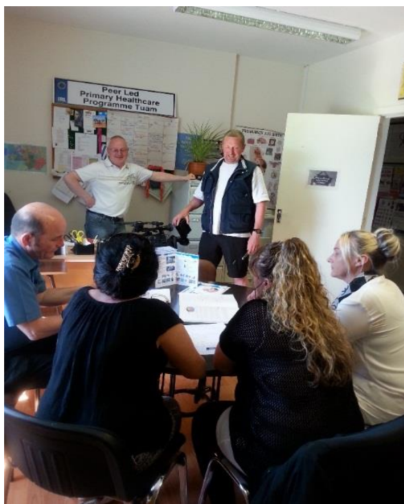
Preparations with the RTE film crew

On May 31 st 2016 a documentary called Keeping Ireland Alive: The Health Service was produced and filmed over a 24-hour period by RTE. PHC was one of the locations chosen to film at. A film crew followed three CHWs to experience their Outreach Work at a family home in Parkmore Estate discussing Asthma care with a mother and her 8-year-old boy.