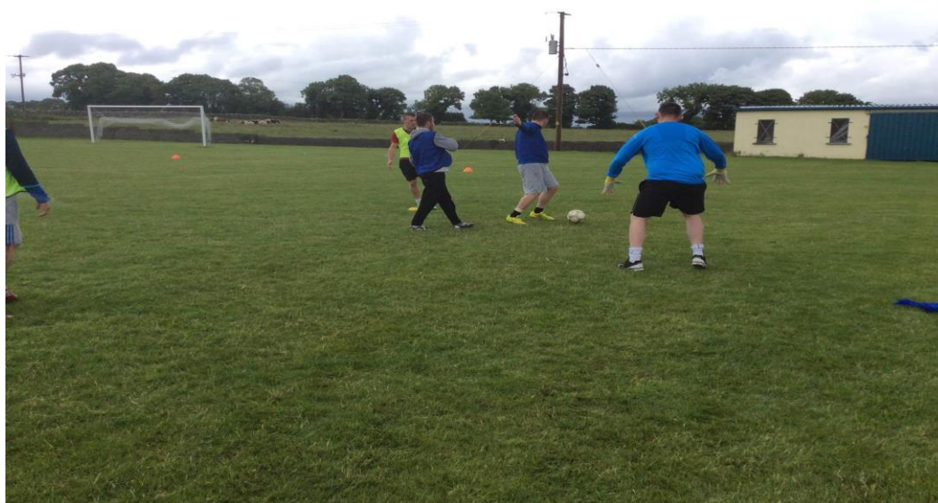
Some Participants is the Men's Soccer Tournament

WTID took part in Traveller Pride week this year. The project celebrated many events these included, a concert by the music project for parents, a Men's soccer Tournament where 7 teams competed, the tournament was held in Roscommon. Trophies and medals were presented to the winning team. A health screenings clinic was held on the day for all men who wanted to avail.