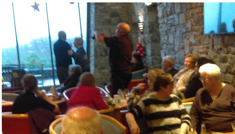
In the bar enjoying the music

Congratulations to winners of our raffle