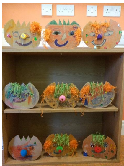
Pumpkins for Halloween

A very successful Afterschool Programme was delivered weekly by three PHC staff at Parkmore Community Childcare Service. The programme focused on engaging children between the ages of 7-12 years old to celebrate culture and explore healthy lifestyle behaviours in an enjoyable manner. The group participated in making St. Philomena Cords and why members of the Traveller community wear them; making St. Bridget's Crosses; cards for various events and healthy foods, brushing your teeth and fun physical activities.