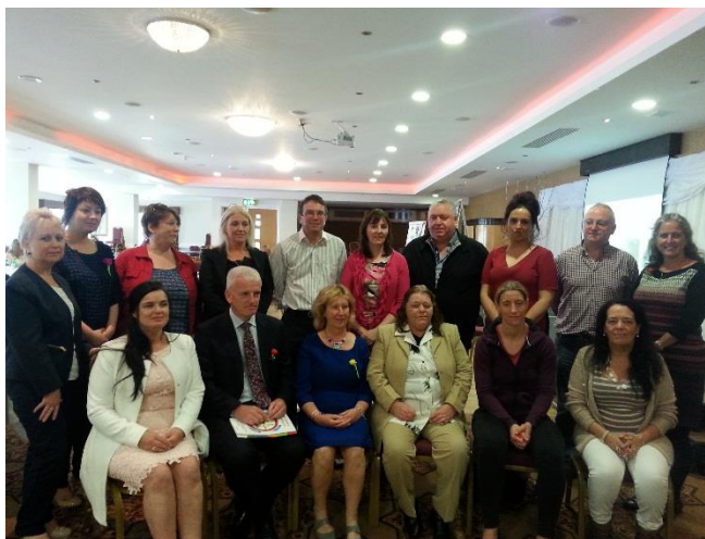
THU members: THU Celebration Event

It was a very positive event reviewing all the achievements of the THU to date and provided a forum to discuss challenges that need to be overcome with regards to the health status of Travellers.