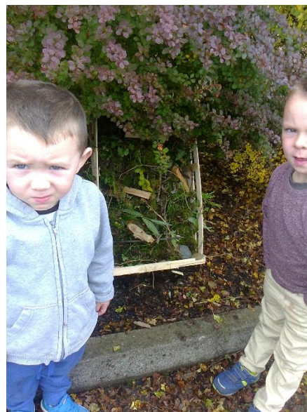
Proud boys with their Insect Hotel