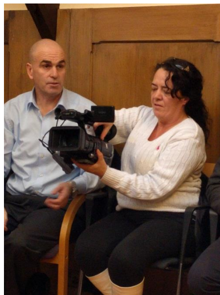
Learning how to use the video camera at the National Museum of Ireland – Country Life