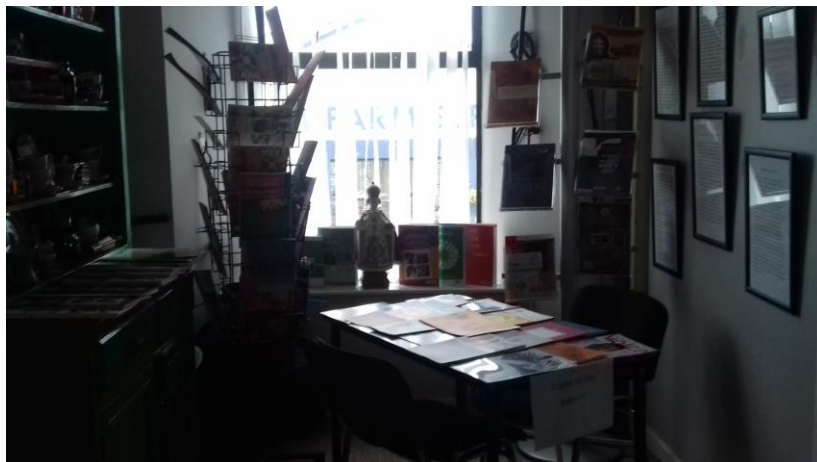
Youth Work Library

2016 was a challenging year for the youth project, there was a gap in which there were no CE workers, so this did have some effect on the delivery of services to young people. Two youth Leaders came on board in December 2016 and we are excited to be planning the year ahead.