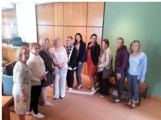
Small Changes Big Difference: Launch July

Small Changes Big Difference is an important culturally appropriate programme which has been developed aims to begin to address, in particular diabetes and cardiovascular disease for members of the Traveller community. Small Changes can help people to reduce their health risks and make a big difference to their quality of life. The programme was developed in partnership with the Traveller community through many of the Primary Health Care Programmes across the country. PHC Tuam and PHC GTM drafted the Healthy Eating module. It was launched in July in Limerick and it received an Irish Healthcare Awards 2016 Commendation under the Best Patient Lifestyle Education Project section.