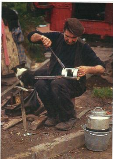
A Tinsmith at work