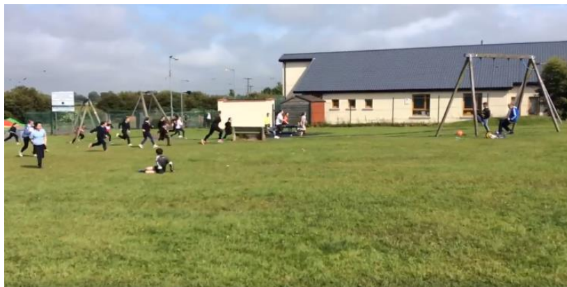
Summer Camp fun and games