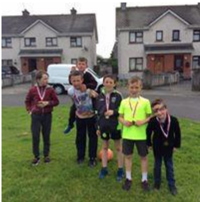
U12 – U14 medal winners