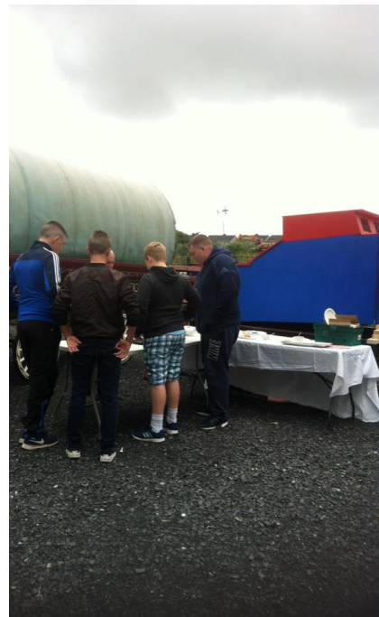
Having a well earn tea-break