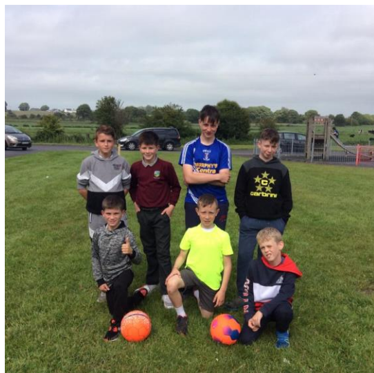
Young soccer players at Traveller Pride Week

WTID took part in Traveller Pride Week this year. The project celebrated a number of events the included, a concert by the music project for parents, street league soccer and a regional soccer event that was played in Roscommon with all the Traveller Projects in the West. There was a very successful cultural event held in the Parkmore Creche.