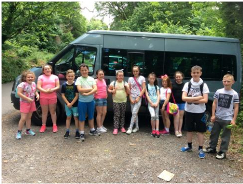
Trip to Castle Hackett

The teenager's events took place at the allotment's and the play area Parkmore Tuam