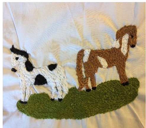
Patches made by the Community Health Workers for the quilt being displayed in the National Museum of Ireland- Country Life