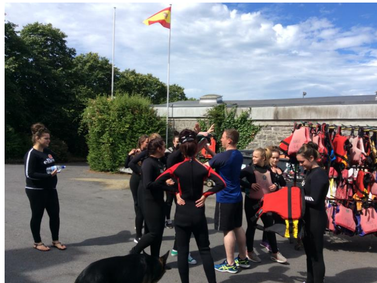
Life skill's group outing at Petersburg