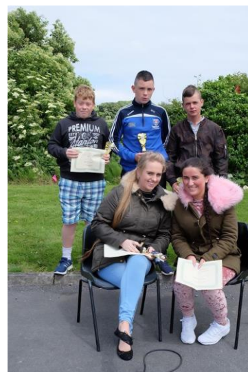
Young people who obtained awards for community work