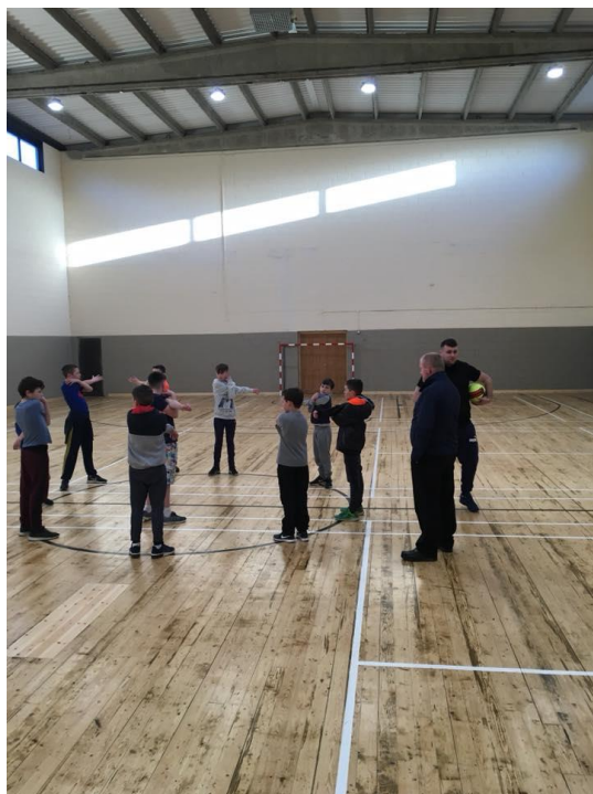
Young boys soccer & sports group, St. Pats