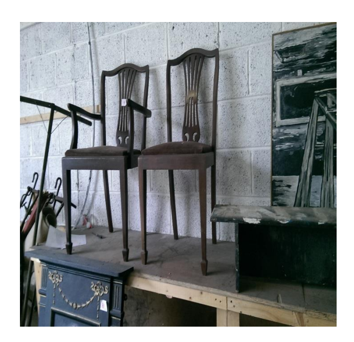
Items awaiting auction

WTID held a Community Auction selling off items which the project had held in storage for a number of years. The aim was to make space for new initiatives.