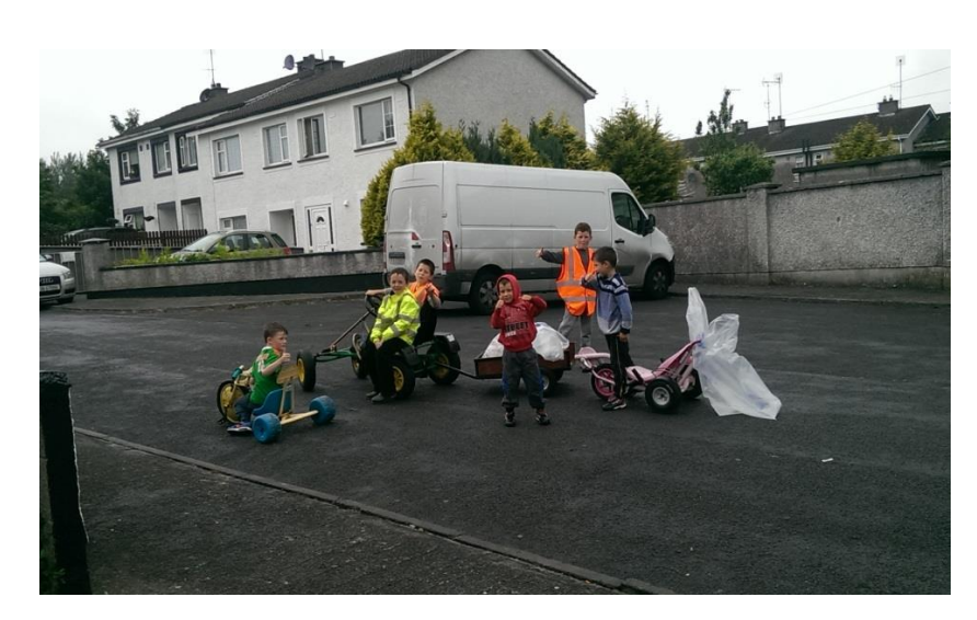
Children helping out in the Tidy Town clean-up day.

The children of Parkmore Estate were involved in keeping their area tidy. During the Tidy Town clean-up day. The children were very enthusiastic and very creative in their method of gathering litter by using their own vehicles.