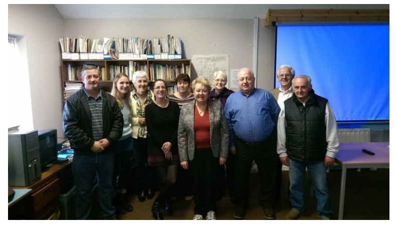
Some of the residents of Parkmore Estate and Old Race Course Road who were involved in Needs Analysis

The Needs Analysis furnished residents and services provides with the different issues involving the area and WTID staff felt that information on the rights and entitlements of householders needed to be provided. Threshold Galway Branch provided a very informative open morning to Tuam Community at WTID.