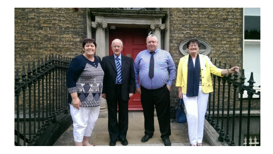
Members of the Tuam, Home Babies Graveyard Committee

Tuam Home Babies Graveyard Committee comprised of Community Development Workers, Primary Healthcare Coordinators, WTIDC management and staff with community personal. The work of the committee included the establishing of the group, media, site visits, meeting with families of relatives, referrals to Tulsa for family records, fundraising, and meeting with the commissioned sculptor for the project, submission to the Minister of Children and Youth Affairs, submissions to the Commission of Investigation of the Mother and Babies. The commission is due to publish this report 2016. The committee will then hopefully be in a position to move forward with their work of erecting the plaques to the 776 children that are buried at the site of the old St Mary's Mother and Babies Home in Tuam that closed its doors in 1961. The site is also to be converted into a Memorial Garden, if so wishes my the relevant parties.