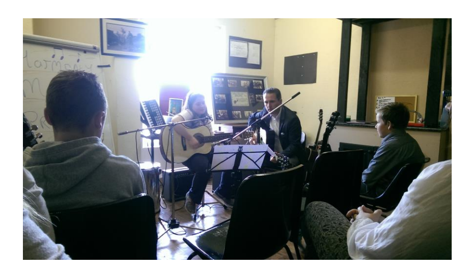
The summer Concert

The music project takes place three times a week and currently has 30 members a project coordinator and music tutor. The children put on a music concert for the parents and families during July. It was really rewarding to watch the children blossom through music and singing with skills they have developed over the year.